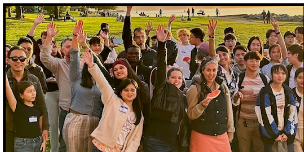
International students welcomed by Chi Alpha

All of our ministries have launched, with record interest from students since Covid. There were 97 students last week at CWU, 195 at WWU, and similar highs for pretty much all our Chi Alpha campus ministries. We are praising God today for a great start to the year. Please pray for ongoing revival!