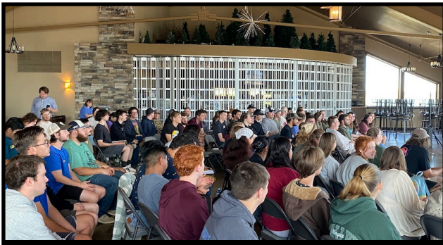
Packed with students at WSU/UI fall breakaway