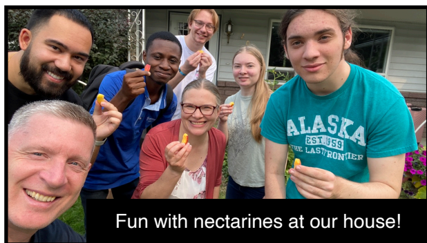
Fun with nectarines at our house!

At Whatcom Community College, Chi Alpha doesn't yet have a meeting on campus. Nonetheless, we are seeing students extend themselves to connect. In the photo ( left ), there's 60+ international students who came for food and conversation about God. Some of these students also trek across town to join the WWU Chi Alpha meetings. I love this because the university campus is a unique 'reverse' mission field... they come from all over the world to study here. It's an incredible opportunity to be hospitable.