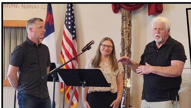
Sharing about Chi Alpha in Woodland