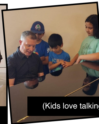
(Kids love talking to us at churches!!)