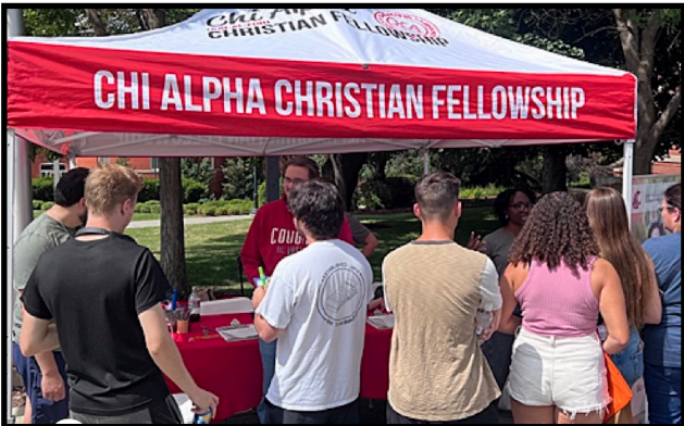
Welcome week table at WSU

The quarter-schools (WWU, CWU, Bellevue, etc) will be having their own Fall retreats soon. We love what God does in this time. Please pray for salvations, baptisms, and healing testimonies at our retreats!