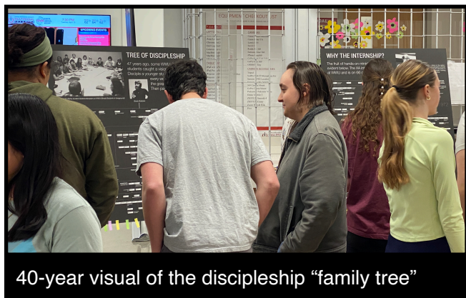
40-year visual of the discipleship "family tree"